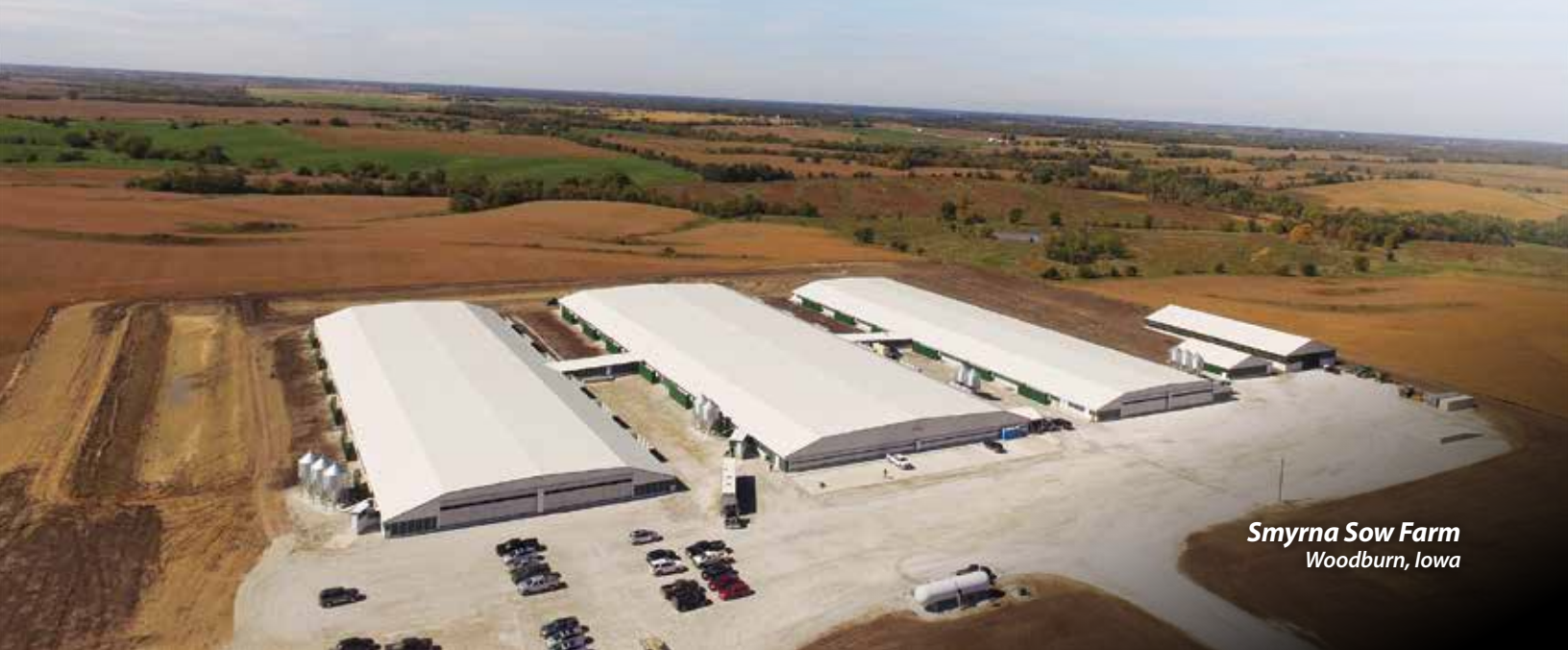
Smyrna Sow Farm Woodburn, Iowa