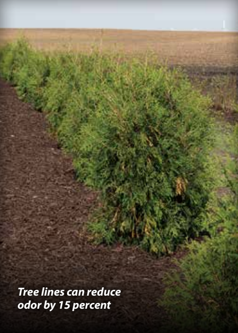
Tree lines can reduce odor by 15 percent