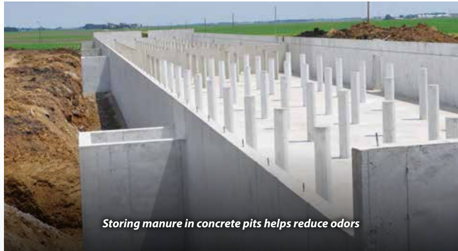
Storing manure in concrete pits helps reduce odors

In addition to measuring odor levels, the Iowa DNR study also looked at trends associated with various livestock species, sizes of operations, types of operations, conditions and manure application methods.