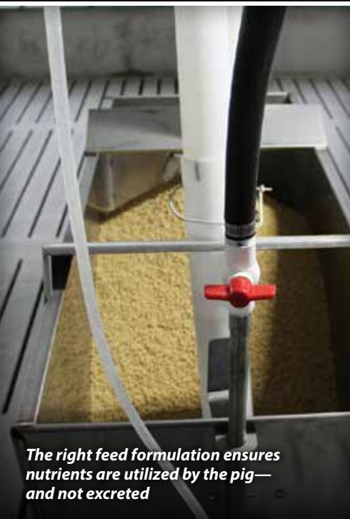
The right feed formulation ensures nutrients are utilized by the pig—and not excreted