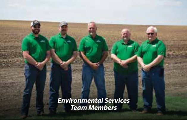
Environmental Services Team Members