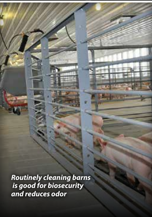
Routinely cleaning barns is good for biosecurity and reduces odor