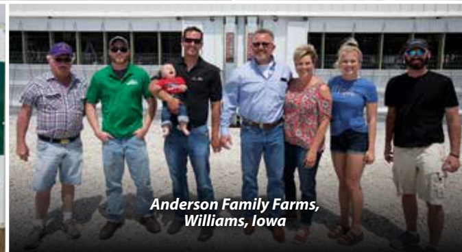
Anderson Family Farms, Williams, Iowa