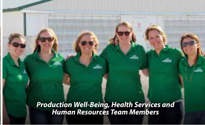
Production Well-Being, Health Services and Human Resources Team Members