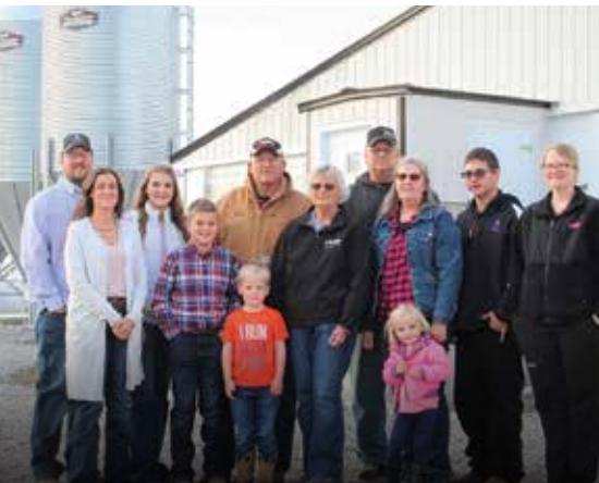
Four Generations at Vansice Family Farms