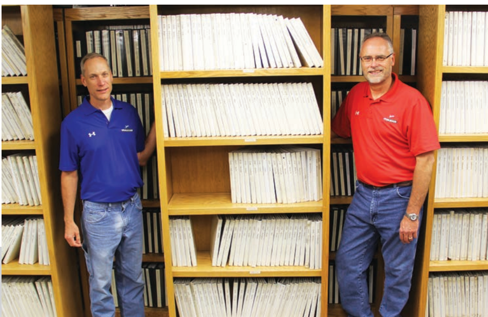
Manure management plans and environmental records for every site are housed in binders and stored in the nutrient management office.

Kratchmer’s group has to file yearly manure management plan (MMP) updates for nearly all the Iowa Select Farms production sites and submit them to the counties in which the farms are located or an application field is located. Completely new MMPs have to be submitted every four years which must include all the general information about the site, how much manure is produced, the nutrients that are produced, application rates and the fields to which manure is applied.