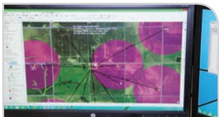
The Environmental Services group uses aerial imagery as the base maps and layers are then added for contours, county tile lines, flood area, water sources and cemeteries.

A third project is the development of an automatic pit-depth measurement tool in a joint project with Iowa State University. "The goal is to develop an instrument that allows the building manager to see his real-time pit depths." "Our farms are the brick and mortar of our business," concludes Bankson. "We take responsibility in maintaining our farms and treating them with respect. We believe in being good neighbors and work hard to protect our environment, serve as industry leaders in land stewardship and add value to our natural resources by replenishing the crop ground with essential nutrients from swine manure."